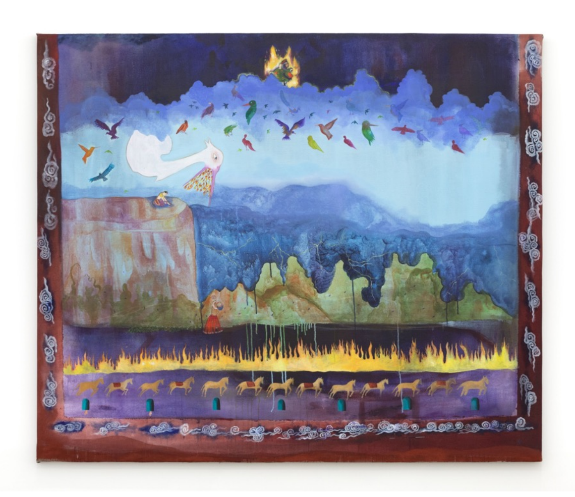
Noorain Inam A house on a hill, a car in the middle of the sea, 2023 170 x 190 cm Acrylic, oil and ink on linen