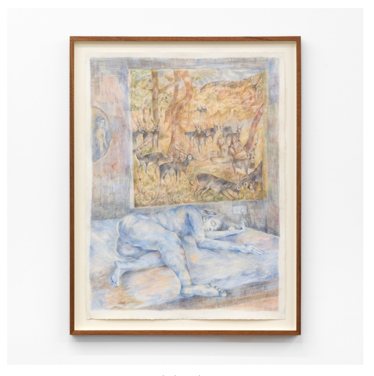
Shailee Mehta The clearing, 2023 Pencil on paper 84.5 x 66 cm (framed)