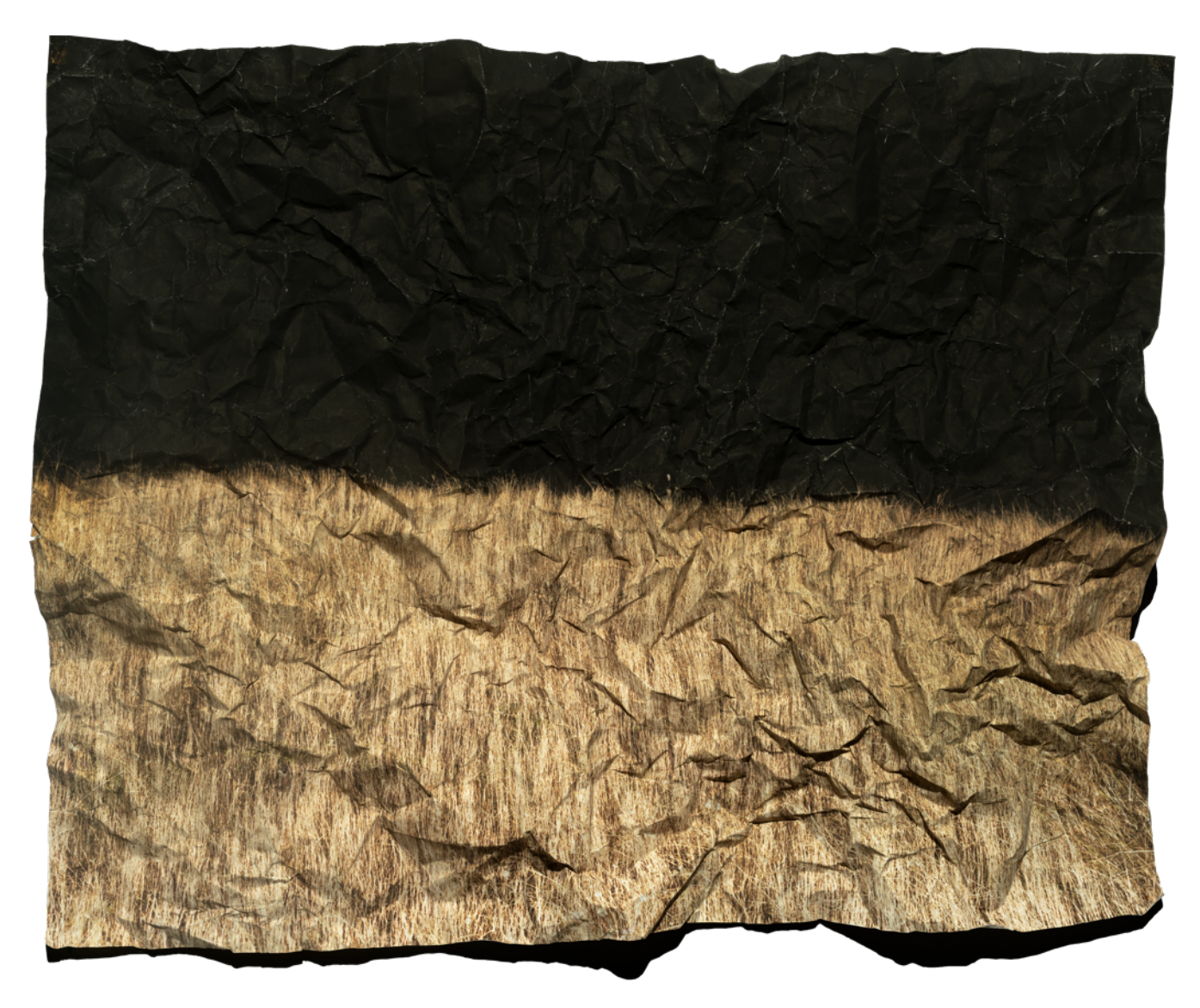
Tenzing Dakpa Manifest 014 (Series) Crushed, archival inkjet print 16 x 20 in