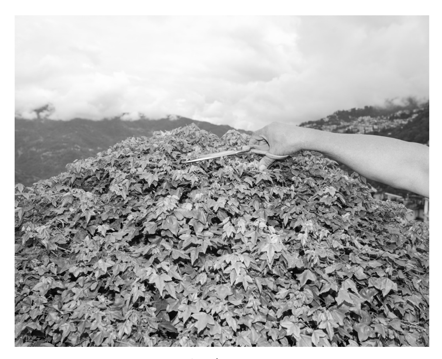
Tenzing Dakpa Scissors, (The Hotel Series), 2018 Archival pigment print 28 x 34 in Edition 1 of 8 + 1 AP