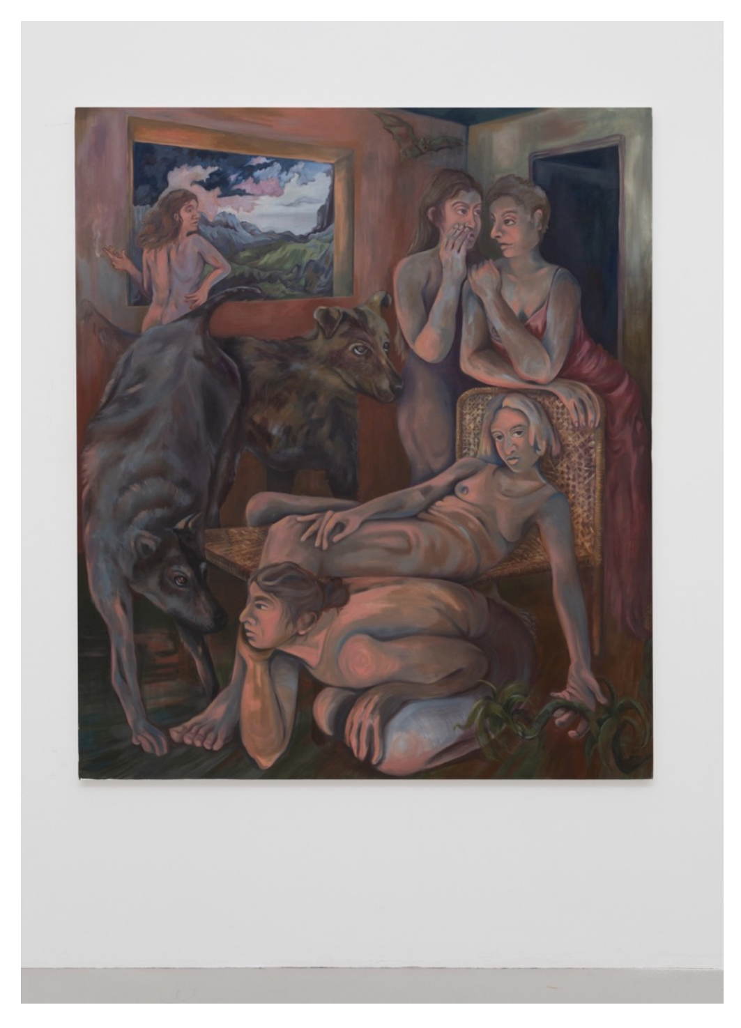
Shailee Mehta Disruptor / In Tacit Accordance, 2022 Oil on Canvas 177.8 x 152.4 cm