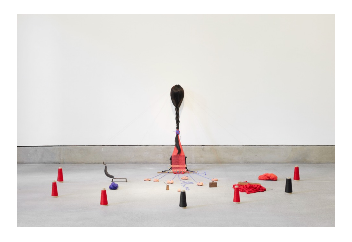
Gather your spools. Let your hair down for me. Gently. Here. Undo. 2021 Glasgow Centre for Contemporary Art & Liverpool Biennial, 2023 Installation with hair, threads, metal, clay, woven textiles. Dimensions variable