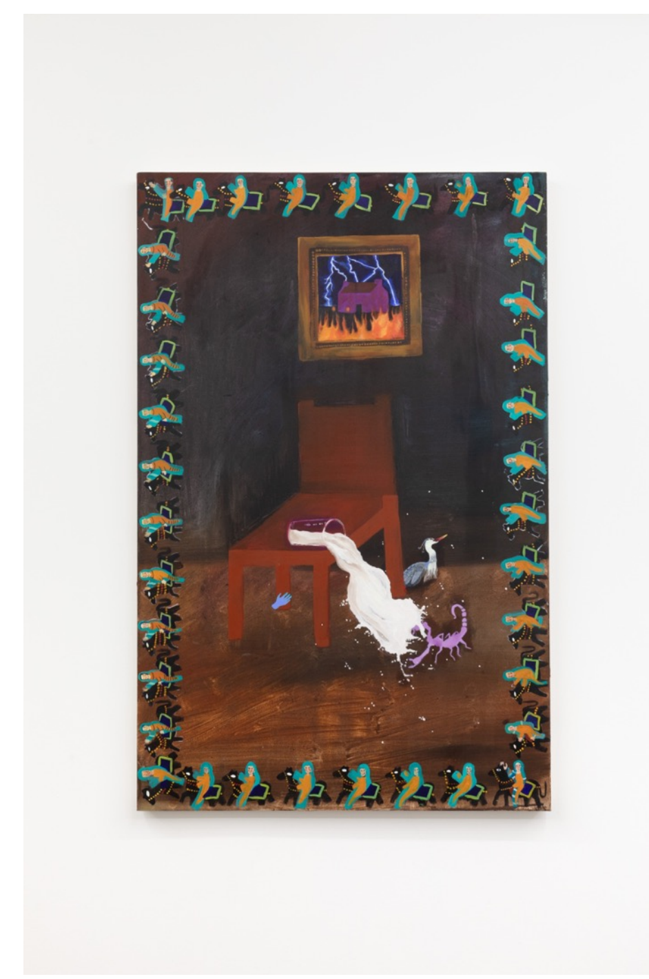
Noorain Inam An irresistible and indiscriminate urge to sting, 2023 Acrylic on canvas 140 x 90 cm