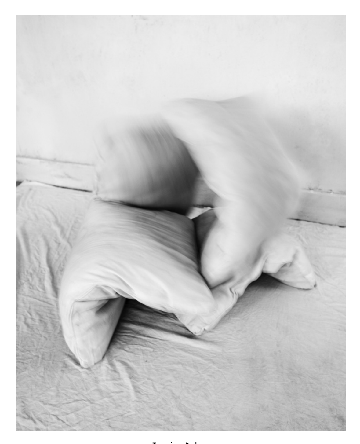
Tenzing Dakpa Stairs 02, (The Hotel Series), 2018 Archival pigment print 34x 28 in Edition 1 of 8 + 1 AP