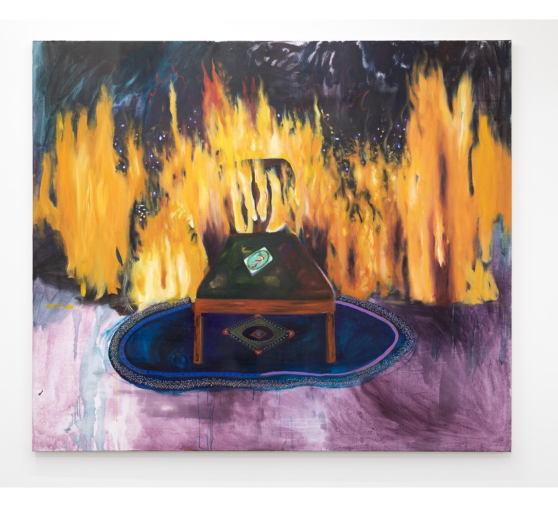
Noorain Inam 15 sleepless nights, 2022 Acrylic on canvas 180 x 210 cm